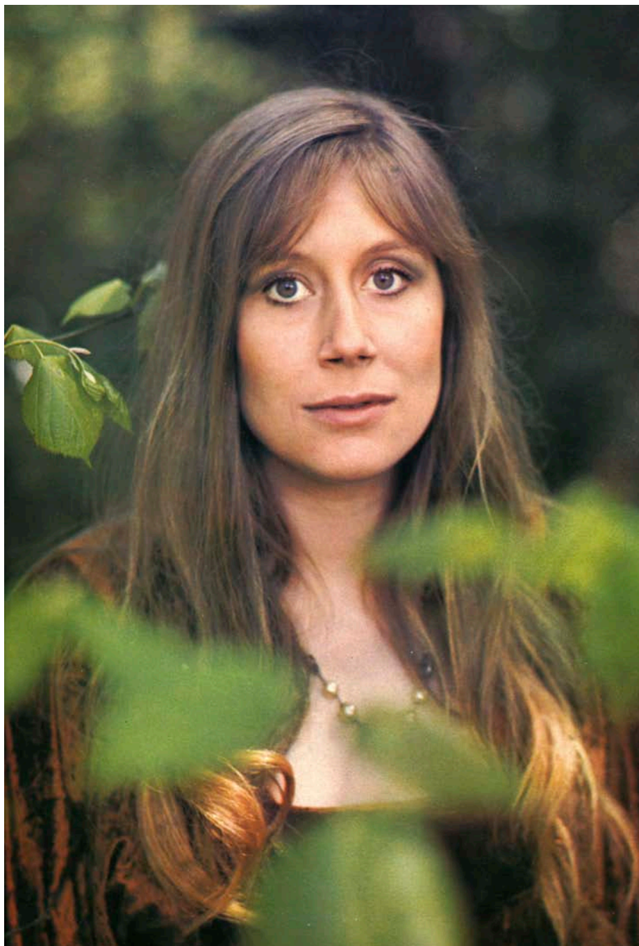
Phonogram Ltd 1976

She became National Education Officer of the language agency Comann na Gàidhlig , completed a PhD in Gaelic-medium education at the University of Glasgow , and lectured in Gaelic at the University of Strathclyde .